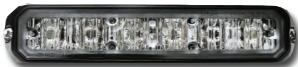
MS6BS Horizontal Optics