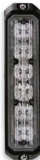
MS6BSV Vertical Optics